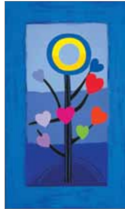
Terry Frost RA Blue Love Tree