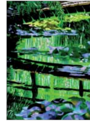
Brendan Neiland Giverny Sunset