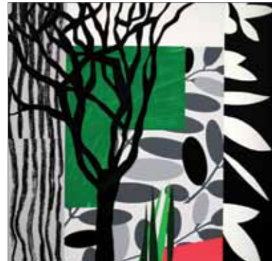
Bruce McLean Agave Americana