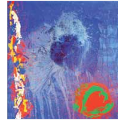
John Hoyland RA Life and Love