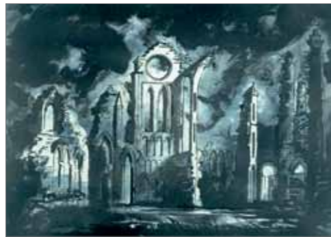
John Piper Arbroath Abbey