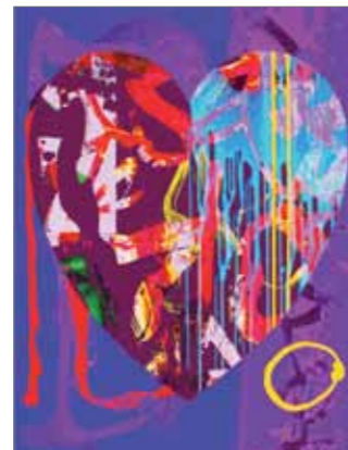
Maurice Cockrill RA Claire's Inspiration