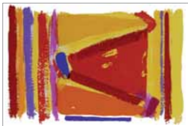
Lunar Notes I Screenprint