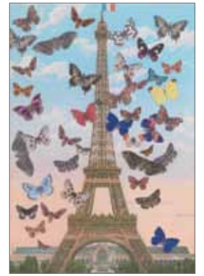
Sir Peter Blake Eiffel Tower