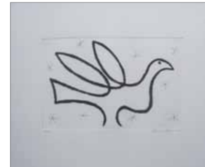
Breon O'Casey RA Bird with Stars