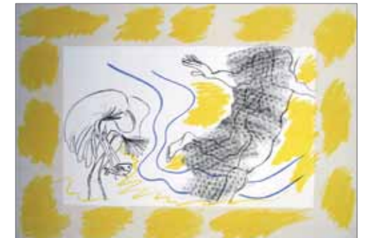
Ceri Richards Poem on His Birthday