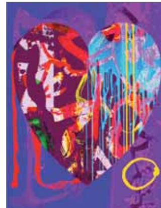
Maurice Cockrill RA Claire's Inspiration