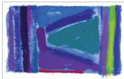
Lunar Notes II Screenprint