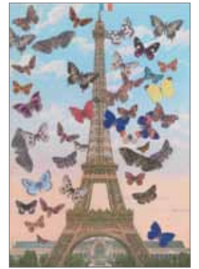
Sir Peter Blake Eiffel Tower