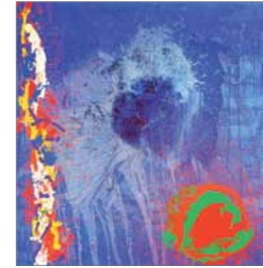
John Hoyland RA Life and Love